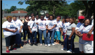
COIT YOUTH TEAM